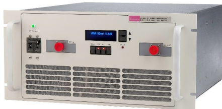
FE MODEL SHOWN

Specifications subject to change without notice