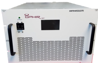
SIMILAR "RE" MODEL SHOWN