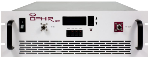
FE VERSION SHOWN