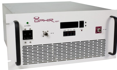
“FE” Front Connector Version Shown