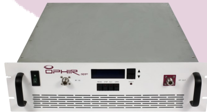
FE MODEL SHOWN